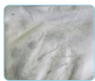
Split microfiber denier provides enhanced absorbency and contamination pickup.

Clear Path Disposable Wipers are designed to be single-use and disposed of immediately after use. By capturing and disposing of spores and other viable pathogens, Clear Path Wipers prevent the cross-contamination of surface areas.