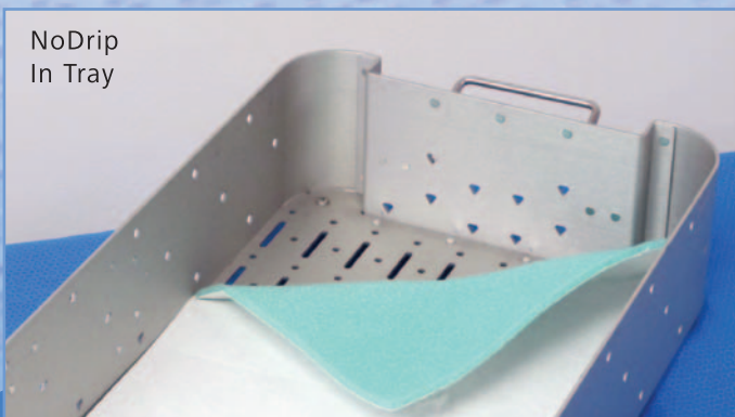
NoDrip In Tray