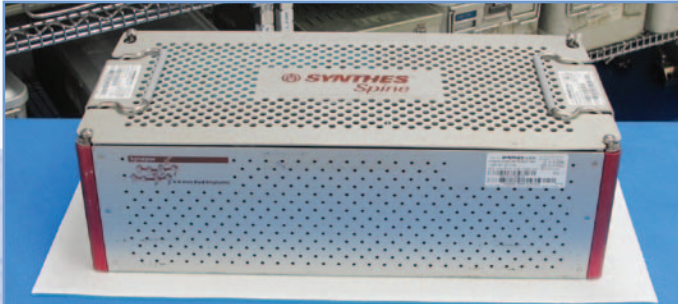
NoDrip Full Sheet Protection