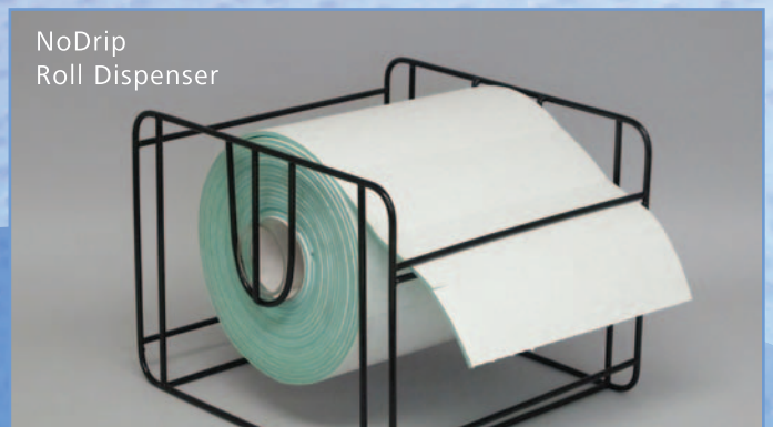
NoDrip Roll Dispenser